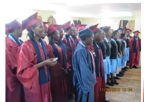
Students singing a special at graduation

Job Skills Training: "Garments of Praise Training Institute", our tailoring school, had 35 students in 2013 and 21 of those students graduated this past November with over 200 in attendance. The program began in January of 2010 with 5 students. Later a feeding program was added to meet the nutritional needs of the students who live in poverty stricken conditions. Garments of Praise donors have provided 14 machines to graduates, presenting them with the necessary equipment to earn an income.