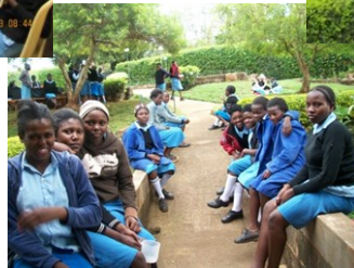
Tailoring students waiting for food