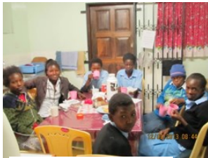
Spending the night before exams

Mission House: Home of our feeding program, Bible studies and temporary shelter for those in need, plus many other vital activities. Often, tailoring students will spend the night at the mission house before exams so that they can get in some additional study time before class. Three young Ethiopian refugees call this place "home", and there are many others who find this house a place of shelter where they can receive comfort and encouragement during their storms in life.