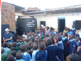
Shalom has more than out grown the present facility

Looking Forward: In 2014 we've added an additional level of training, along with industrial machines, to enhance the students skills. To make this a real life experience, we're developing a program of "group businesses" where 3 or 4 students will join together to share costs and collaborate as they learn to operate a business while under supervision. Exploration is underway into opening a production unit which would allow the 2 nd year students to work alongside experienced tailors and dress makers, as well as generate some income for the school. We are also looking into other areas in which we may be able to provide job skills training.