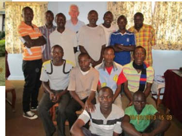
Victory Football Team after a Bible study