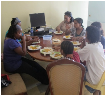
Girls at lunch