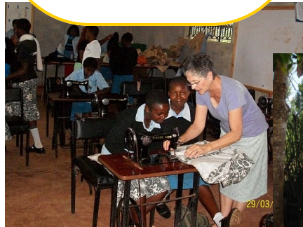
Instructing students Garments of Praise Tailoring Institute

"Without education they have very little hope in this life, and without salvation they have no hope for eternal life"