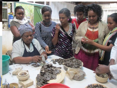
Field trip to see how other refugee women have been successful in business