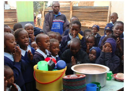
Shalom Learning Center students Thankful for this meal!