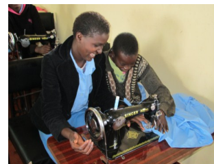
Receiving individualized instruction

Please pray with us as we explore opening a tailoring and dress-making shop within our facility. Such a shop would be able to make school uniforms during the school year, and produce other types of clothing year-round providing additional employment opportunities for students.