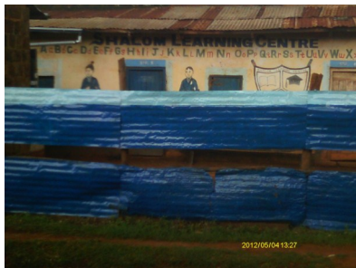
Newly painted fence

Probably the most significant way we can help is to keep hot meals available for the children in both the morning and afternoon. Good nutrition is paramount!