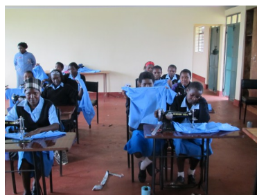
Tailoring students making school uniforms

One long held dream was to have the tailoring students make school uniforms to help the orphaned and poor. Now, with great joy, we can report this vision is being fulfilled, providing uniforms for the most needy primary school students at Shalom Learning Center. It has been