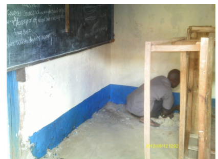
Painting inside classroom

Thank you for your support! It is making a real difference