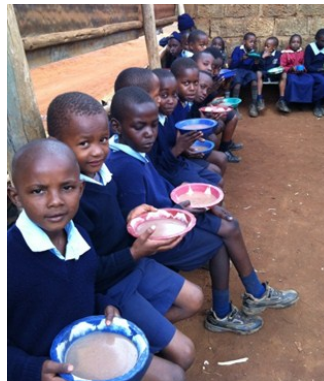
Shalom Learning Center Students

Through our partnering with Shalom Learning Center, we are beginning a new work, a feeding program for the children and their families. Our goal is for them to receive two meals per school day. Many of these families have been ravished AIDS/HIV. Some of these children struggle to care for their younger siblings as they