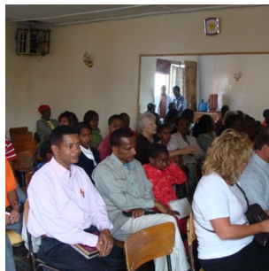
Eastleigh Evangelical Fellowship Church