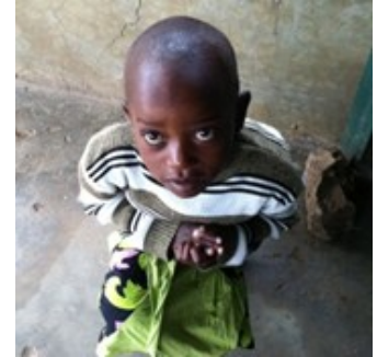
HOPE for the Hungry

have become orphans, barely able to survive. Having regular meals will dramatically improve their health