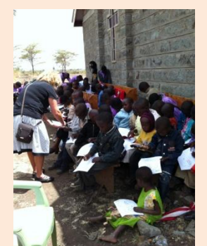
Coloring pictures that matched the Bible story.

Members of the team taught chapel everyday at the Bible College when we were in the area. We were able to teach seminars with sessions for men and women as well as preaching service in 4