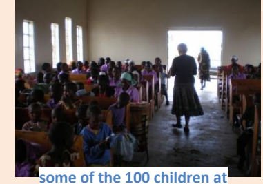
some of the 100 children at Emmanuel Church