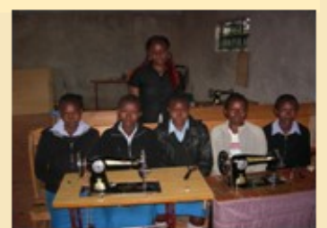
First class with rented machines