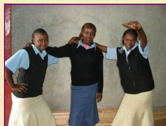
Students in the skirts that they had sewn